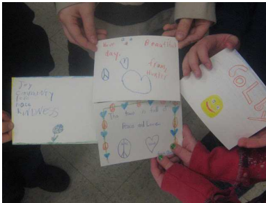
Completed random notes of kindness ready for stamps!

Second, the Brandon Food Shelf called us hoping we would do a food drive. We agreed. Students set a goal of two bags of groceries per classroom. Ms. Grodin has sweetened the deal saying if students fill 10 bags, she will dye her hair Legend blue!